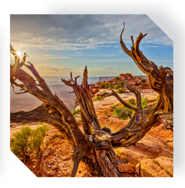
Ancient Bristlecone Pine Forest