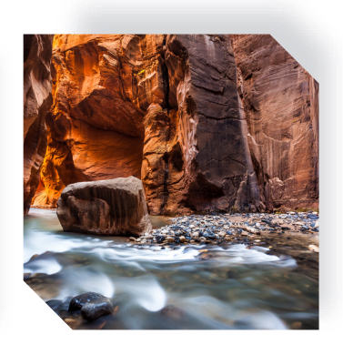
Zion National Park -The Narrows