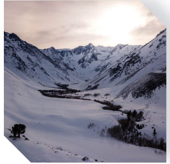
<u>Eastern Sierra -</u> Mammoth Mountain