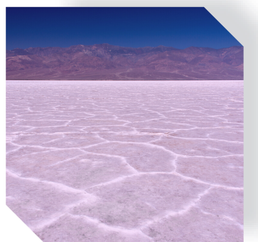
<u>Death Valley -</u> <u>Badwater Basin</u>