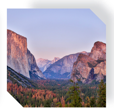
Kern River Valley