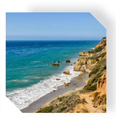
Malibu Coast Beaches