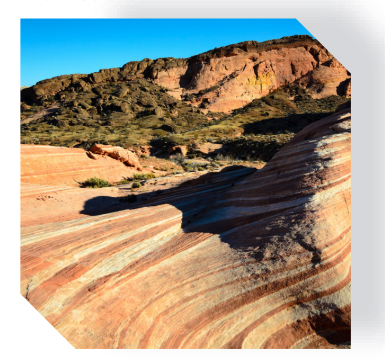
Valley of Fire State Park