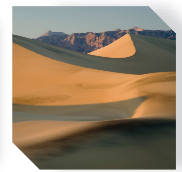
<u>Death Valley -</u> <u>Mesquite Dunes</u>