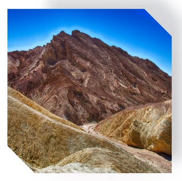
<u>Death Valley -</u> <u>Golden Canyon</u>