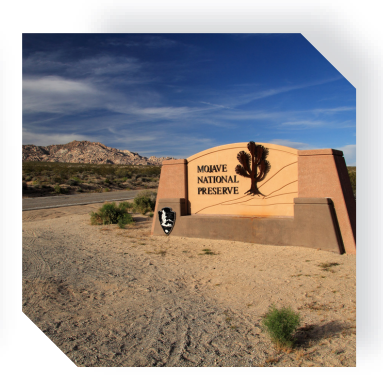
Mojave National Preserve