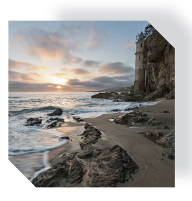
Victoria Beach in Laguna Beach