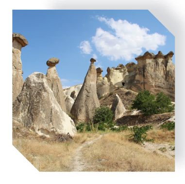
<u>Eastern Sierra -</u> <u>Mono Lake</u>