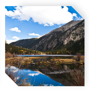
<u>Eastern Sierra -</u> Cottonwood Lakes