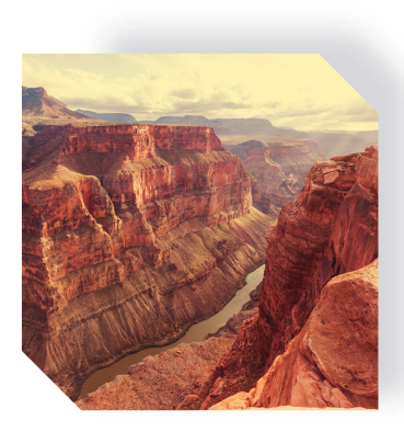
Grand Canyon National Park