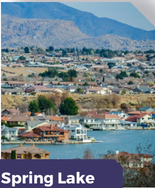
Spring Lake Valley